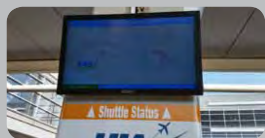
Repeat Signage: Harrisburg International Airport