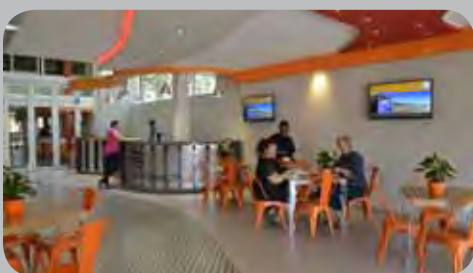
Repeat Signage: Caxton Publishers, SA