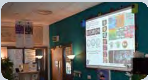
Repeat Signage: Howard Park School, UK