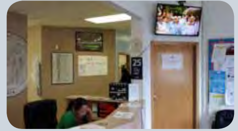
Onion Lake Cree Nation, Saskatchewan