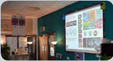
Repeat Signage: Howard Park School, UK